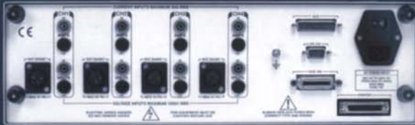
PA4400A-3 3 Channel Instrument PA4400A-4 4 Channel Instrument